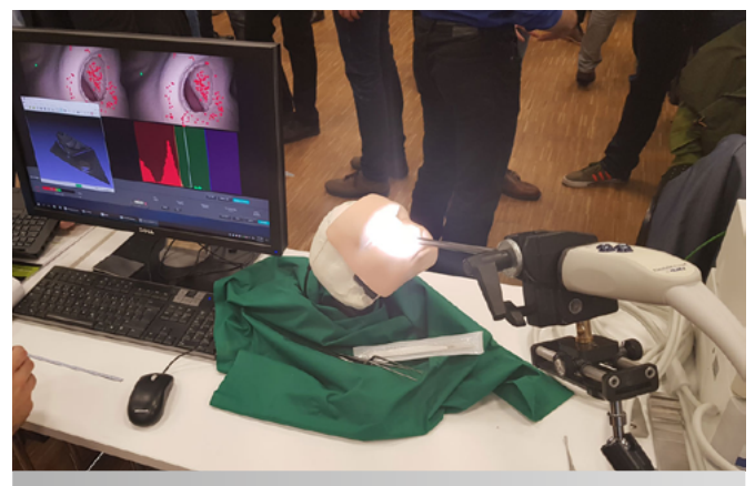
Demo setup for the COMPASS project at the Mittelstandskonferenz 2018 in Berlin.

At this year's Mittelstanskonferenz organized by the Federal Ministry of Education and Research (BMBF), the COMPASS project was presented at a booth in the sector 'Human-Technology Interaction'. In this project, research is being carried out to improve the OR navigation. During the exhibition an assistance system for stereo endoscopy in the ENT area was demonstrated.